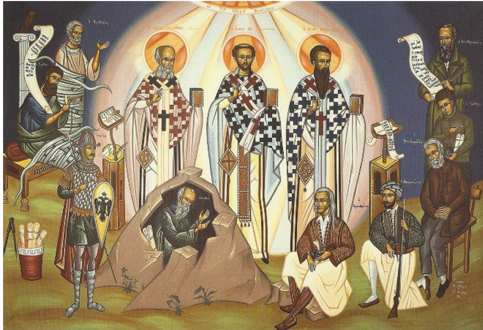
FEAST OF THE 3 HOLY HIERARCHS—JANUARY 30 St. Basil the Great, St. Gregory the Theologian, and St. John Chrysostom