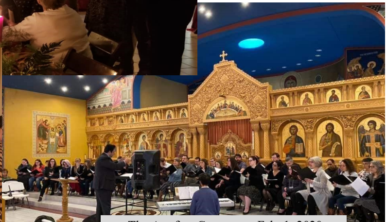
The Artefact Concert on Feb. 1, 2020 HUGE CHOIR!