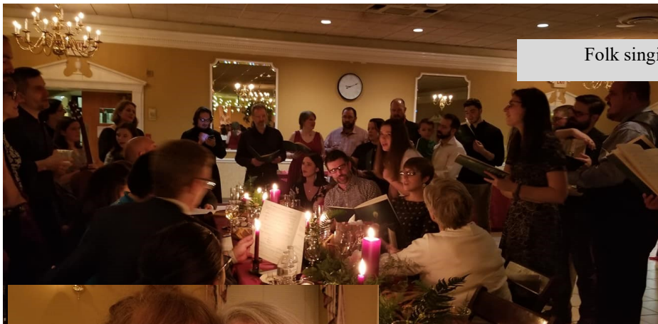
Folk singing at the grand feast

For more information: www.artefactinstitute.com