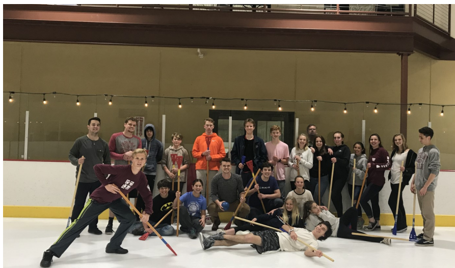
Youth Group Evening of Broomball—March 31, 2018

5/3/18 Regular Youth Group times 5/10/18 Regular Youth Group times (Fire on Father) 5/17/18 Regular Youth Group times 5/24/18 Special Activity—Both groups from 6-8 p.m. 5/31/18 Regular Youth Group times