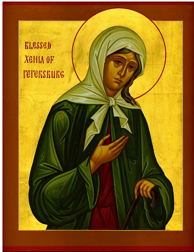
St. Xenia of Petersburg—January 24

Venerable Xenophon, his wife, Mary, and their two sons, Arkadios and John, of Constantinople; Translation of the relics of Venerable Theodore the Studite