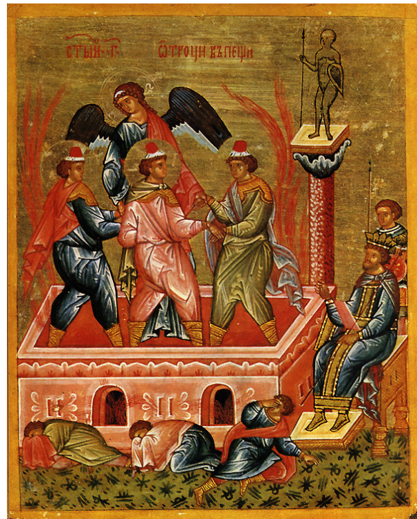
Prophet Daniel & the 3 Holy Youths in the Furnace

Tone 3 / Eothinon 6; Fore-feast of & Sunday before the Nativity of Christ (The Genealogy) Virgin-martyr Juliana of Nicomedia; Martyr Themistokles of Myra in Lycia; Peter, Metropolitan of Moscow and all Russia