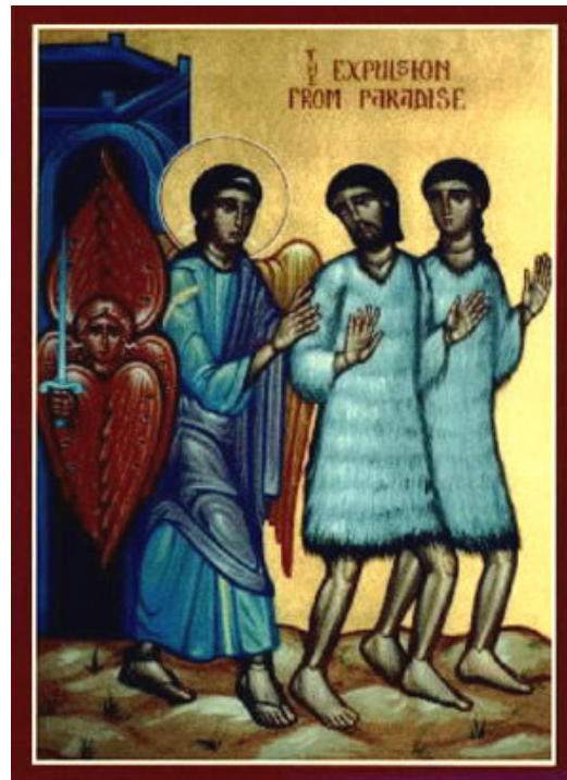
Expulsion of Adam & Eve from Paradise

Venerable Alexios the 'Man of God;' Theosteriktos the Confessor of the Pelecete Monastery; Patrick, bishop of Armagh and enlightener of Ireland; Venerable Makarios of Kalyazin