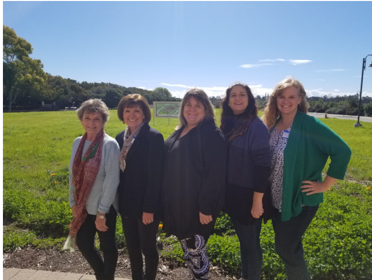
LEADERSHIP TEAM (From left to right)