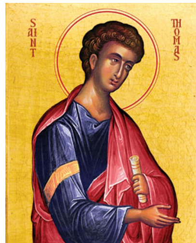
APOSTLE THOMAS, OCTOBER 6

Eudokimos of Vatopedi Monastery on Athos