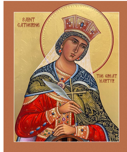
Great Martyr Catherine of Alexandria (Nov. 24/25)