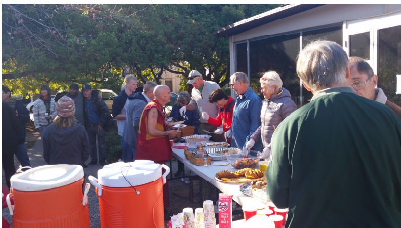
Photos of St. Brigid Fellowship Outreach Breakfast On Christmas Morning, 2015

THE INTERCESSORY PRAYER GROUP that meets each week has changed their meeting day to Thursdays at 12:00 noon, to accommodate the new Shower Truck Ministry at the church on Wednesdays. All are welcome to join this prayer group. They alternate every other week praying the Akathist to the Nurturer of Children (and they pray for EACH of the children in our parish by name) and the Akathist of the Inexhaustible Cup.