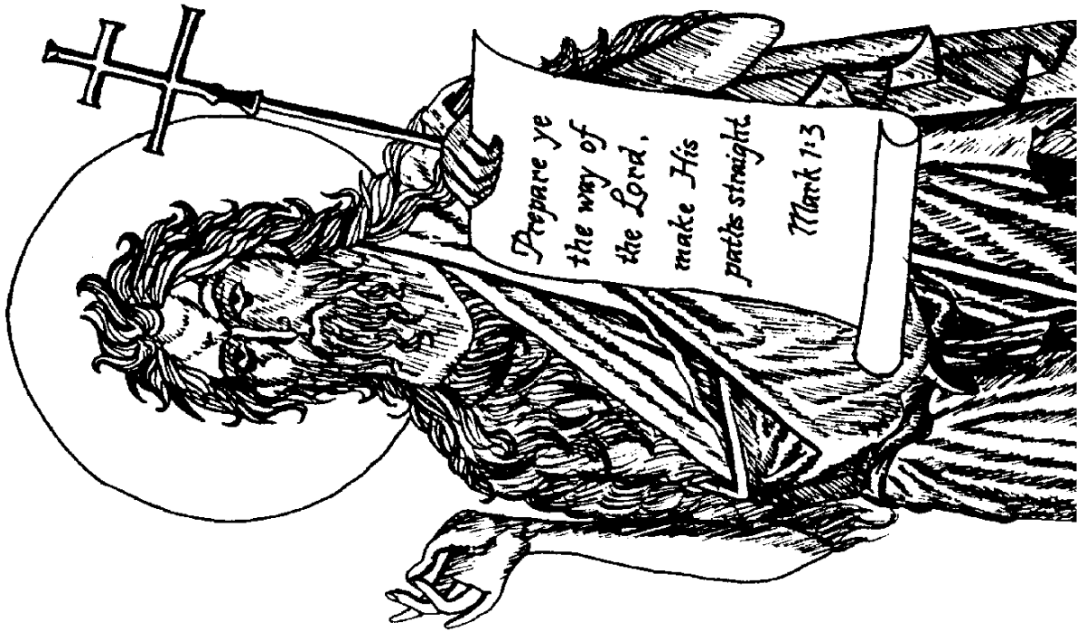
FOR THE CHILDREN TO COLOR DURING THE HOMILY OR AT HOME -