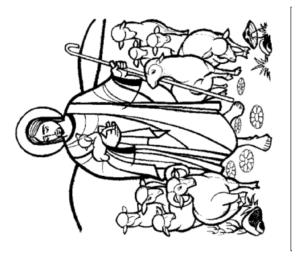
For the children to color during the sermon or at home.