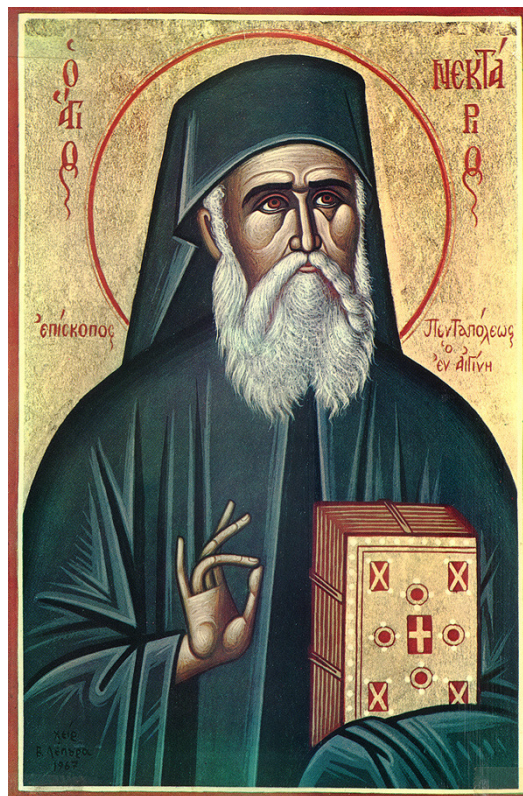
St. Nektarios - November 9

Apostles Olympas, Rodion, Sosipater, Tertios, Erastos and Quartos of the Seventy; Great-martyr Orestes of Cappadocia; Venerable Theostiriktos of Symbola and Nonnus, Bishop of Heliopolis, & St. Nektarios of Aegina—transferred from Nov. 9