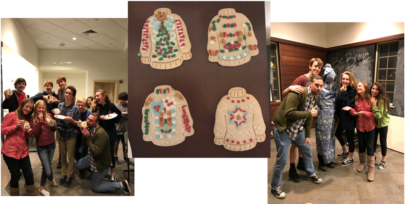
Cookie Decorating and Christmas Games