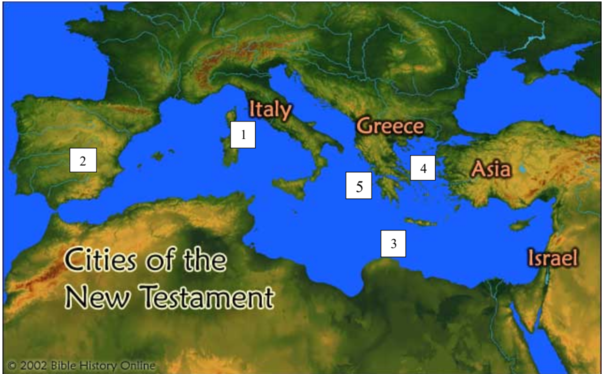
Figure 6 Approximate Route of Paul’s 5 th Missionary Journey 558

At first, they had great difficulty from the governor of the island, who even executed his own daughter and a number of others just because they had become Christians. This governor soon died in a shipwreck as he was pursuing other Christians to a neighboring island. The governor succeeding him gave orders to throw the Apostles Jason and Sosipater into a cauldron of boiling tar. When he beheld them unharmed, he cried out with tears, ‘O God of Jason and Sosipater have mercy on me!’