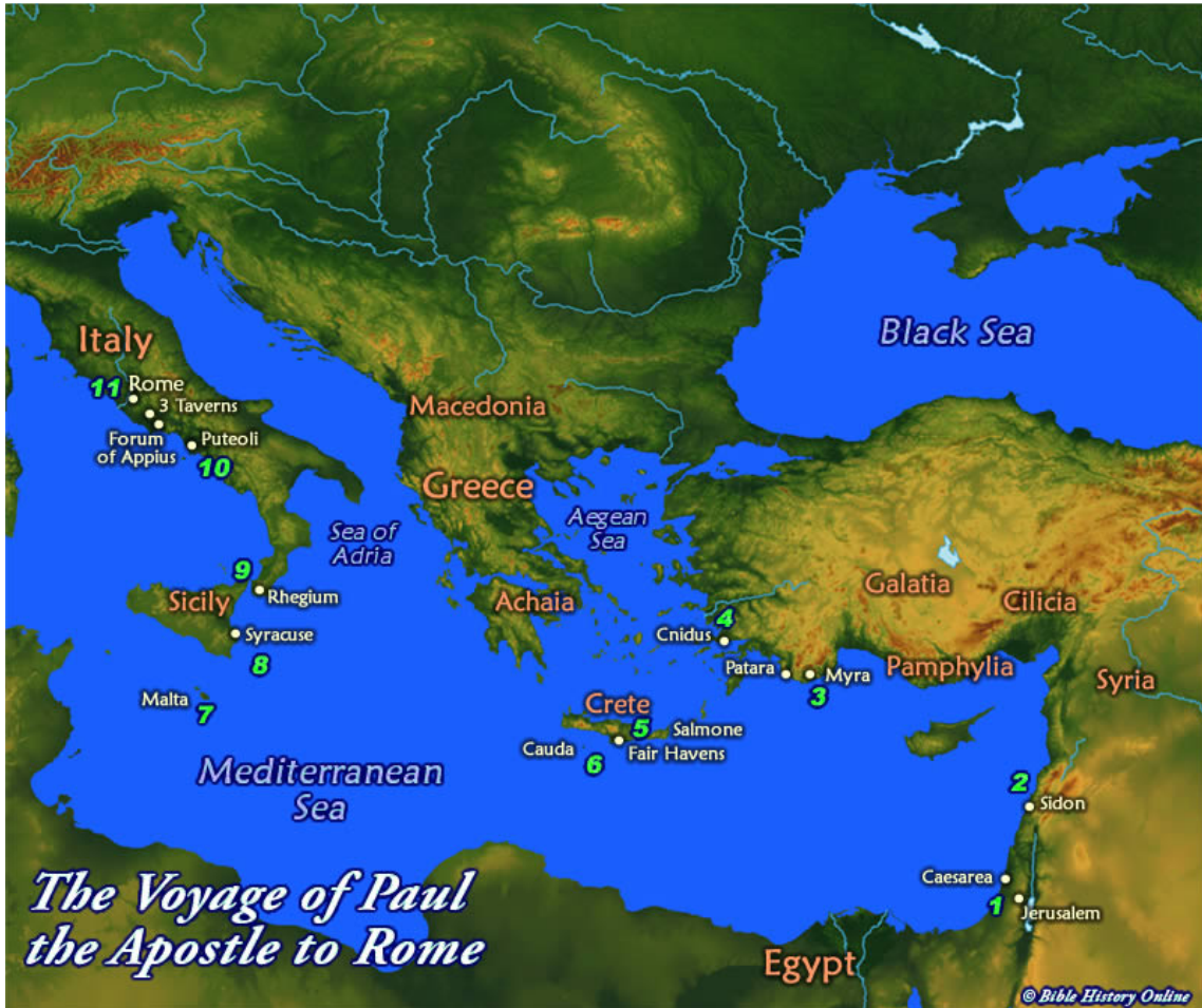
Figure 5 Map of Paul's 4 th Missionary Journey to Rome 456

Chrysostom also said some nice things about Aristarchus in that he desired to travel with Paul as a prisoner to Rome. Even the prophets only referred to themselves as strangers and foreigners, not as prisoners. Paul was treated much worse than most prisoners are treated.