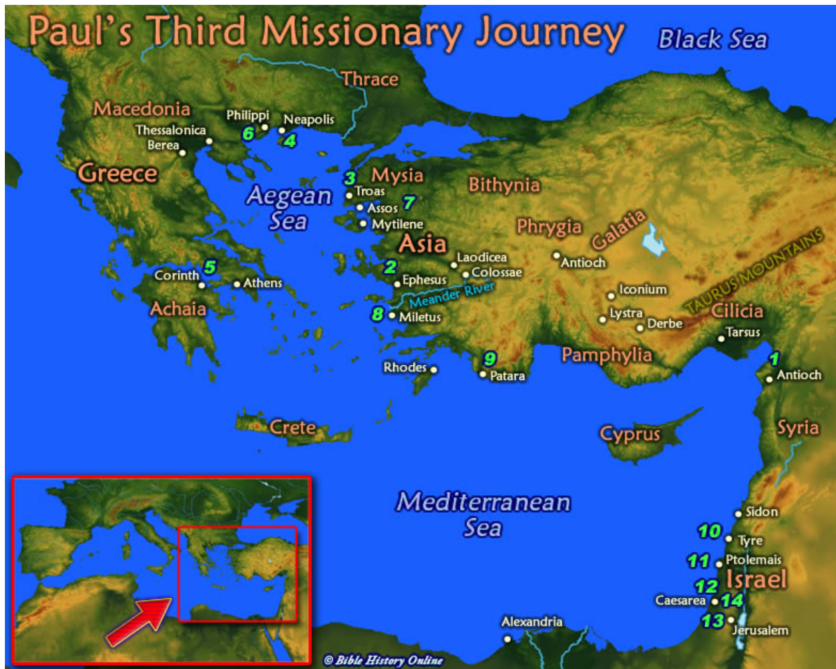
Figure 4 Map of Paul's 3 rd Missionary Journey 291