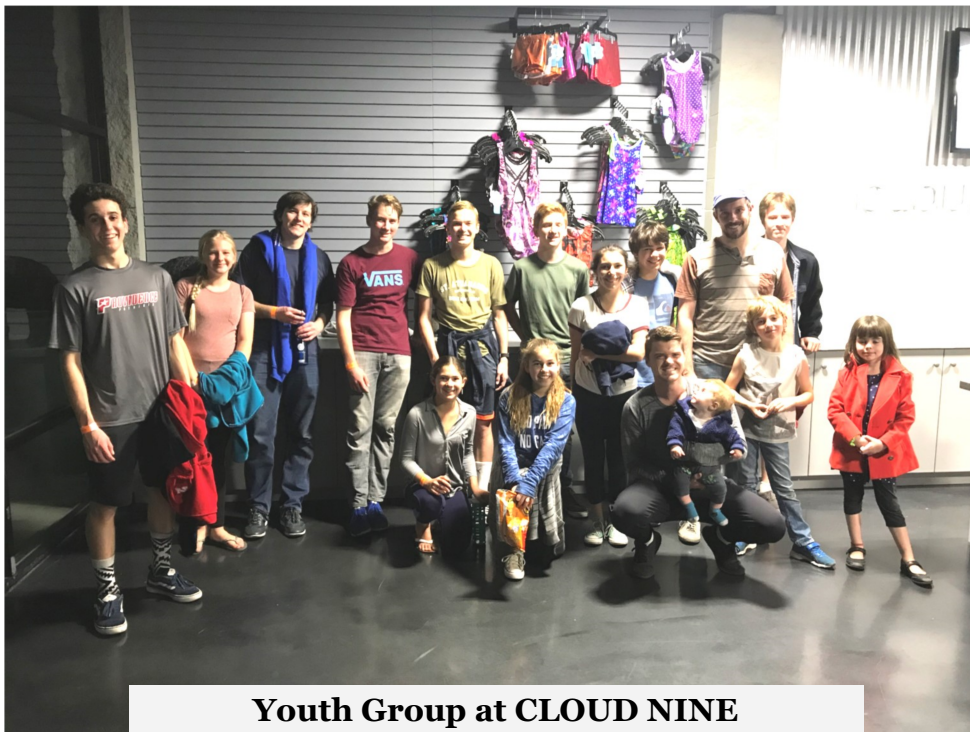
Youth Group at CLOUD NINE January 25, 2018

Sat. 3/31/18 - Lazarus Saturday (come help at work party!), 7:30pm - 9:30pm Broomball after Vespers