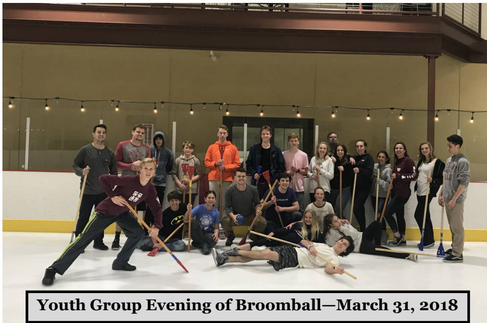
Youth Group Evening of Broomball—March 31, 2018