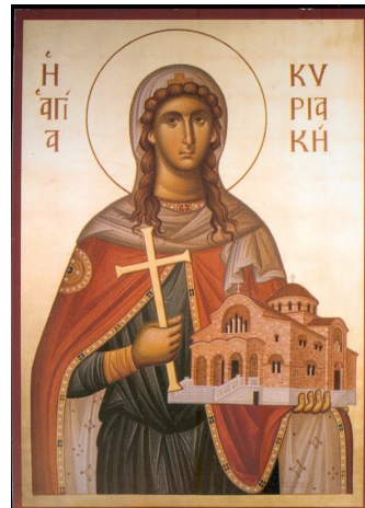
St. Kyriaki of Nicomedia (268-289 A.D.)

Venerable Thomas of Mt. Maleon; Hieromartyr Evangelos, Bishop of Tomi (Constanta) in Romania; New-martyr Polycarp; Eudokia, Princess of Moscow