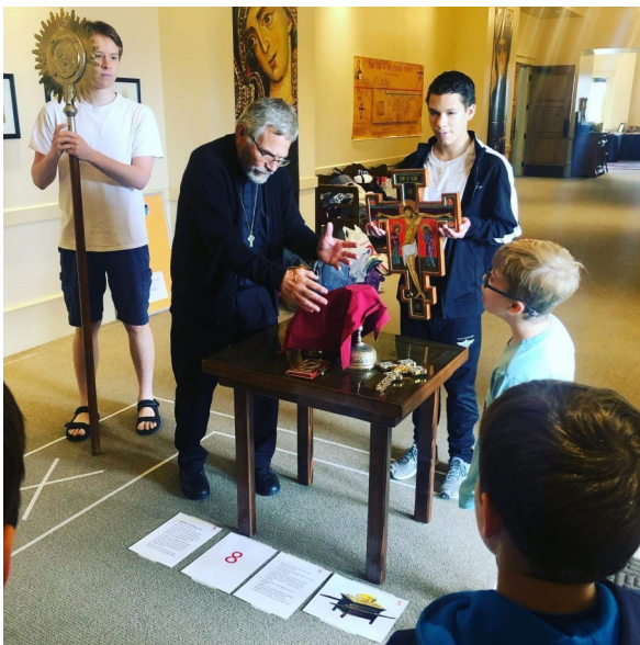
Learning about the Old Testament Temple