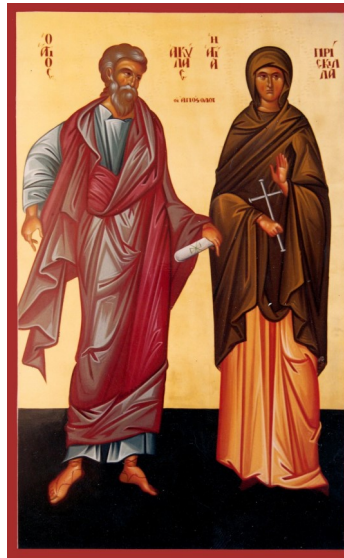
Apostles Aquila & Pricilla of the Seventy

Joseph the Confessor, Archbishop of Thessalonica; Peter, Bishop of Crete; Venerable Onesimos of Magnesia and Nicodemus of the Holy Mountain