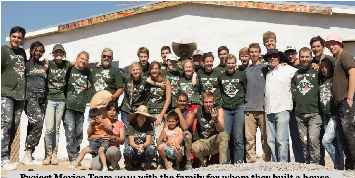
Project Mexico Team 2019 with the family for whom they built a house

July 25 Summer Youth Group—All teens 6-8:30 p.m.