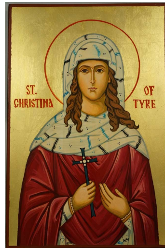
Great Martyr Christina of Tyre—July 24 Lived in the 3rd Century

Righteous Fathers John of Edessa in Mesopotamia and Simeon of Homs (Emesa), The Fool-for-Christ; Parthenios, Bishop of Radovizlios; Martyr Victor of Marseilles