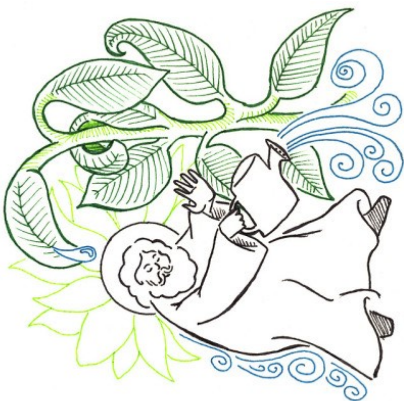
ST. PHOCAS THE GARDENER