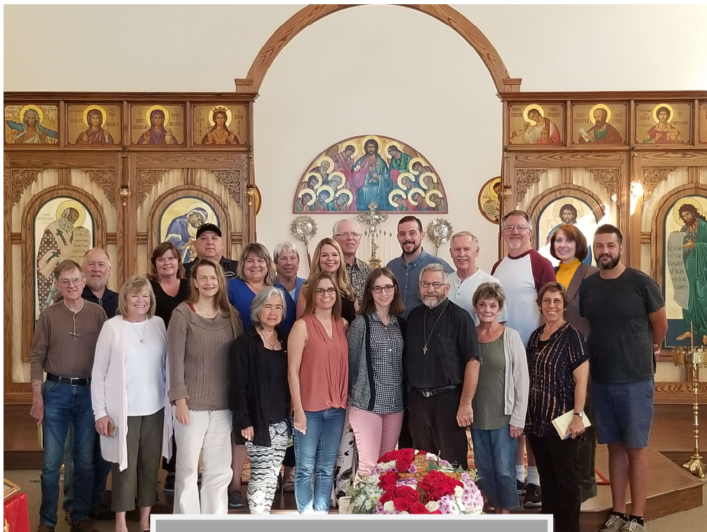
St. Athanasius Ministry Leaders September 2018