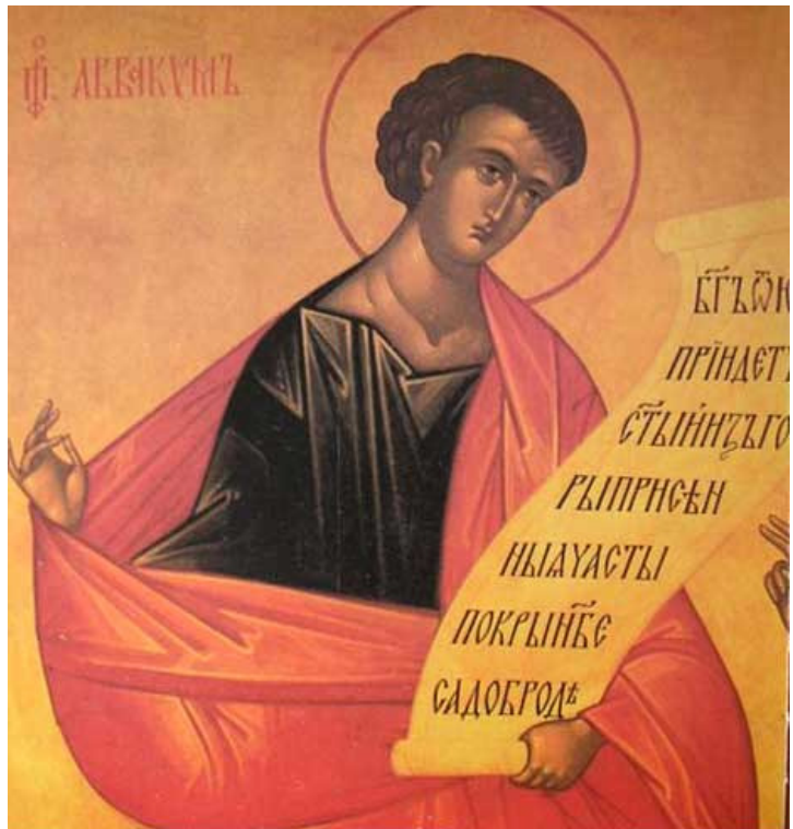
Habakkuk the Holy Prophet

The Holy Prophet Habakkuk; Martyr Habib the New; Martyr Myrope of Chios; Venerable John, Heraclemon, Theophilos and Andrew of Egypt; Martyr Stephen Urosh, the Serbian king; Venerable Ioannikios of Devitch