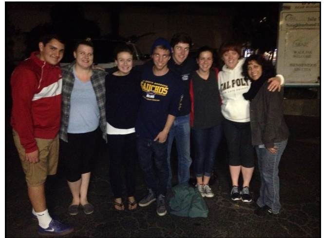
Photo: J2A serving hot cocoa in Isla Vista 11/12/13