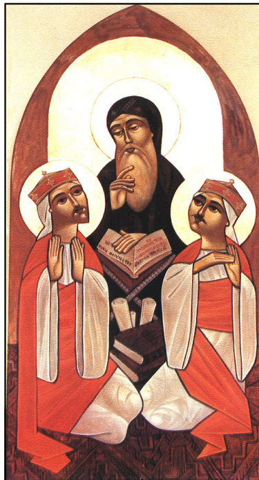
St. Makarios the Great

Venerable Makarios the Great of Egypt, the Anchorite Venerable Makarios of Alexandria; Arsenios, Bishop of Kerkyra; Venerable Mark Eugenikos, Metropolitan of Ephesus, Pillar of Orthodoxy