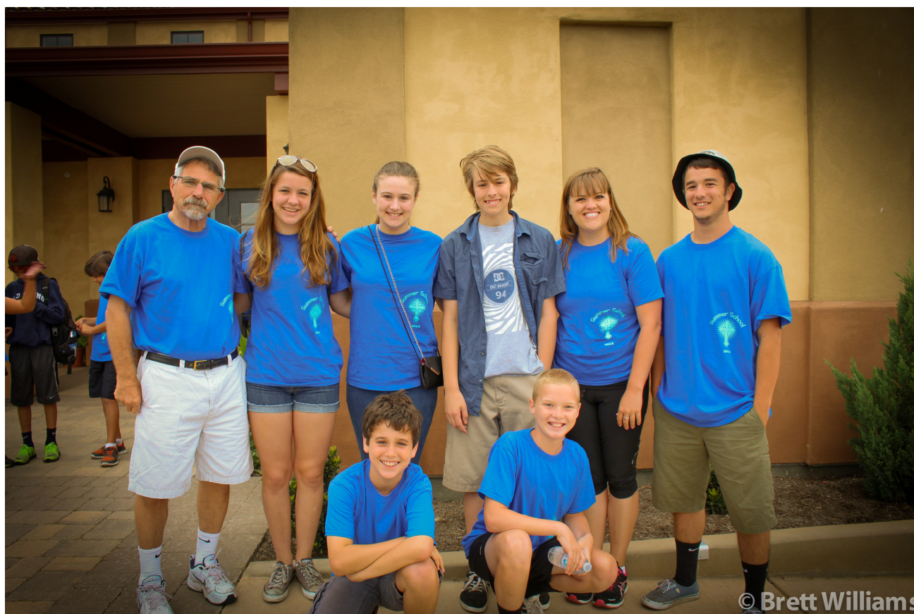
Summer School 2014 Teachers and some of the Teen Assistants