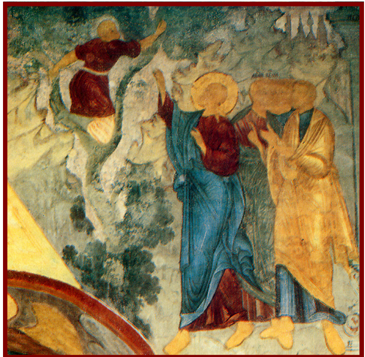
Icon of Zacchaeus in the sycamore tree

Venerable Demetrios the Sacristan; New-martyr Auxentios of Constantinople