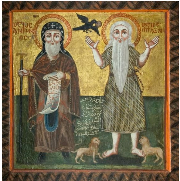
St. Paul of Thebes, the First Hermit (230-341) being visited by St. Anthony the Great

Tone 5 / Eothinon 8; Twenty-ninth Sunday after Pentecost & Twelfth Sunday of Luke Venerable Paul of Thebes & John the Hut-dweller; Venerable Martyr Pansophios of Alexandria; Venerable Gabriel of Lesnovo