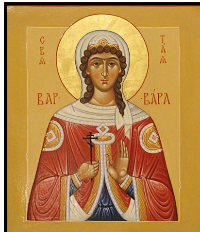
GREAT MARTYR BARBARA—DEC. 4

The Holy Prophet Nahum; Venerable Philaret the Almsgiver of Amnia; Martyr Ananias the Persian; Theoklitos, Archbishop of Lakedaemonia