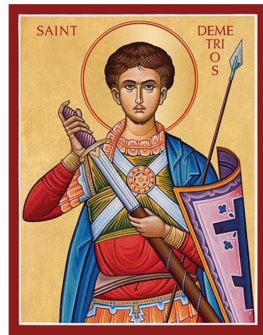
St. Demetrius — October 26

Great-martyr Arethas (al-Haarith) & companions in Arabia Martyr Sebastiana of Heraclea; Righteous Elesbaan, King of Ethiopia