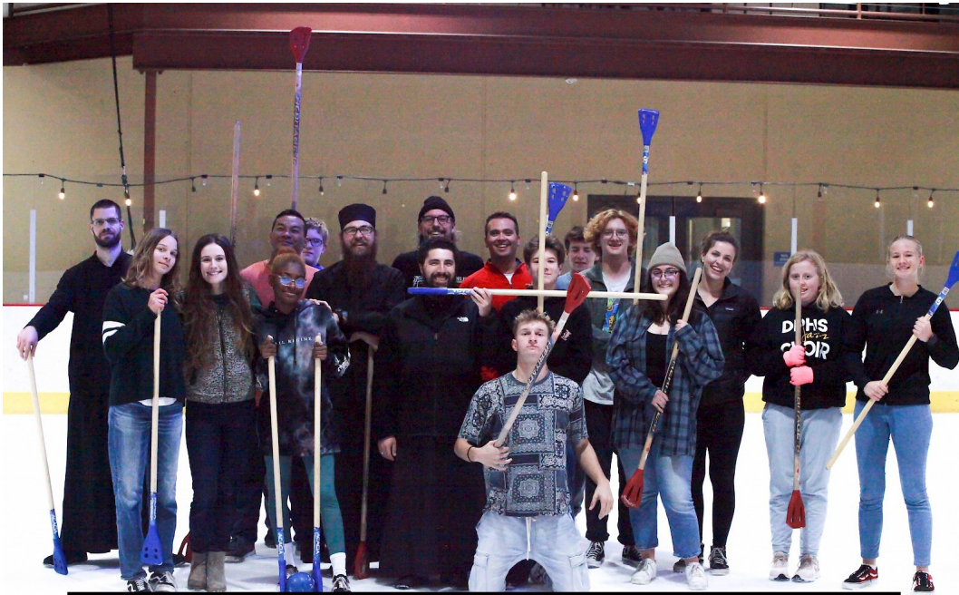
BROOMBALL FEST—DECEMBER 11, 2021 TEENS & YOUNG ADULTS from ST. ATHANASIUS & ST. TIMOTHY'S in LOMPOC